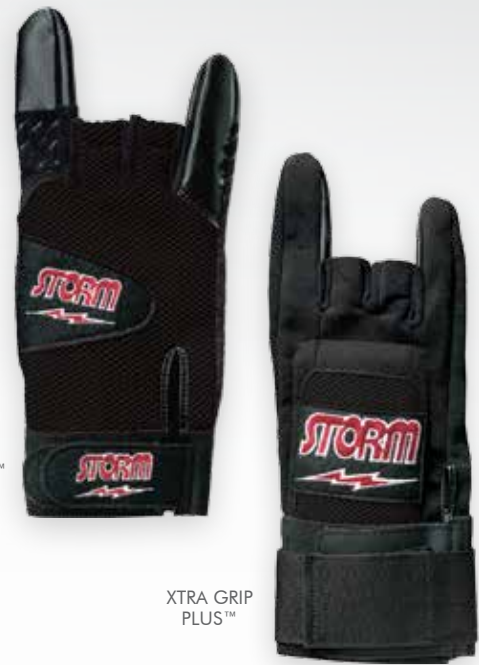
XTRA GRIP PLUS™