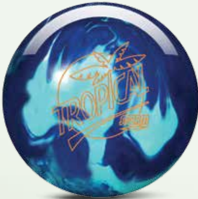
Color: Teal/Blue Coverstock: Reactor™ Pearl Reactive Fragrance: Melon Mint SKU: TZT