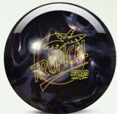
Color: Chrome/Carbon Coverstock: Reactor™ Pearl Reactive Fragrance: Cinnamon SKU: TZB