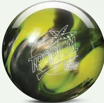
Color: Yellow/Silver Coverstock: Reactor™ Pearl Reactive Fragrance: Pineapple Splash SKU: TYV