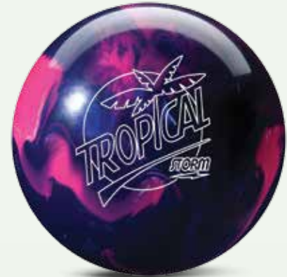
Color: Pink/Purple Coverstock: Reactor™ Pearl Reactive Fragrance: Birthday Cake SKU: TBI