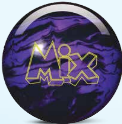
Color: Black/Purple (Hybrid) SKU: TIU