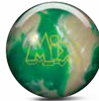
MIX™ (GREEN/WHITE | PAGE 12)