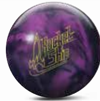
ROCKET SHIP™ (PAGE 7)