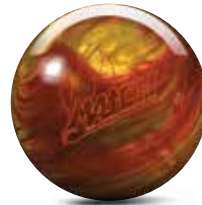
MATCH™ PEARL (PAGE 10)