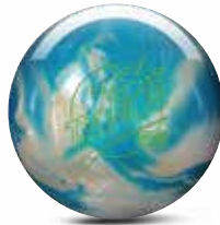
TROPICAL STORM™ (BLUE/WHITE | PAGE 11)