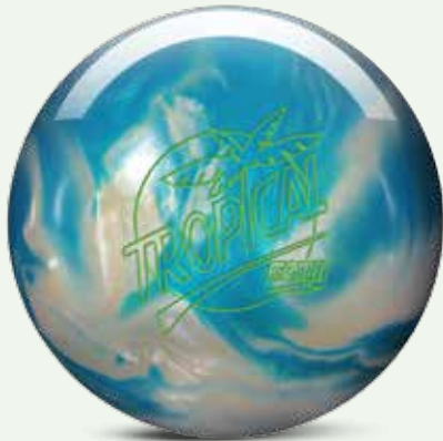
Color: White/Blue Coverstock: Reactor™ Pearl Reactive Fragrance: Blueberry Tart SKU: TWB