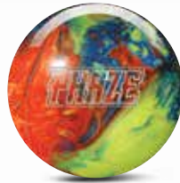
PHAZE™ (PAGE 5)