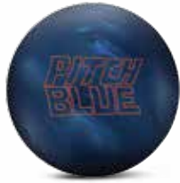
PITCH BLUE™ (PAGE 8)