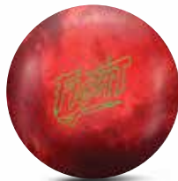
FIGHT™ (PAGE 7)