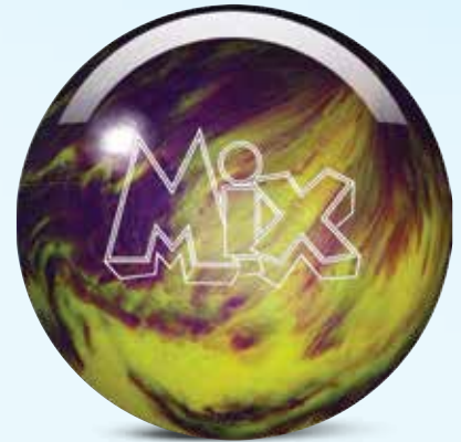
Color: Purple/Yellow (Pearl) SKU: TXO