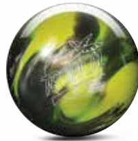
TROPICAL STORM™ (YELLOW/SILVER | PAGE 11)