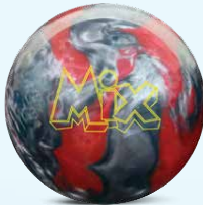
Color: Red/Silver (Pearl) SKU: TID