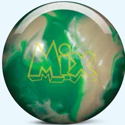
Color: Green/White (Pearl) SKU: TXN