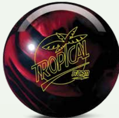
Color: Black Solid/Cherry Pearl Coverstock: Reactor™ Hybrid Reactive Fragrance: Cherry SKU: TCB