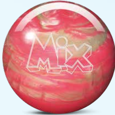
Color: Pink/White* (Pearl) SKU: TXK