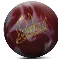
MATCH™ (PAGE 10)