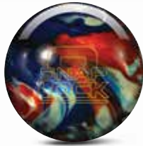
SNAP LOCK™ (PAGE 3)