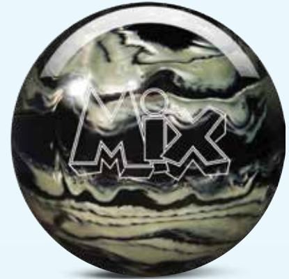
Color: Black/White (Pearl) SKU: TXI