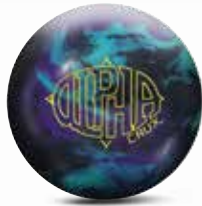
ALPHA CRUX™ (PAGE 4)